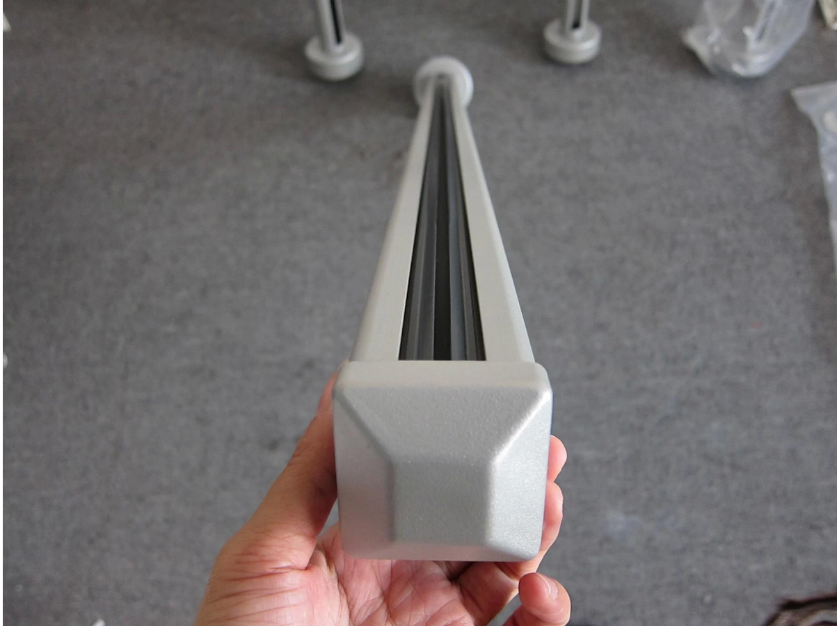
Details Optional finish