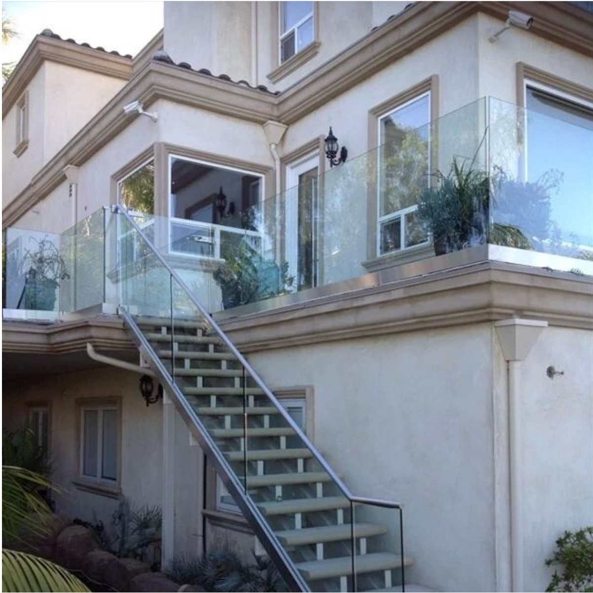
Aluminum u-shape channel for outdoor handrail