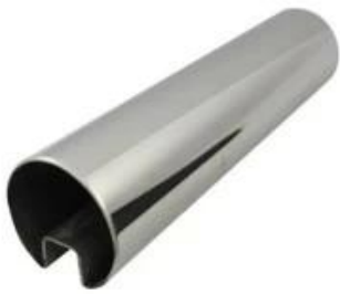
one channel handrail tube