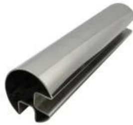
2 channel 90° handrail tube