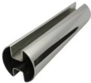
2 channel 180° handrail tube