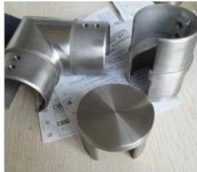
accessories for \phi 50.8mm tube