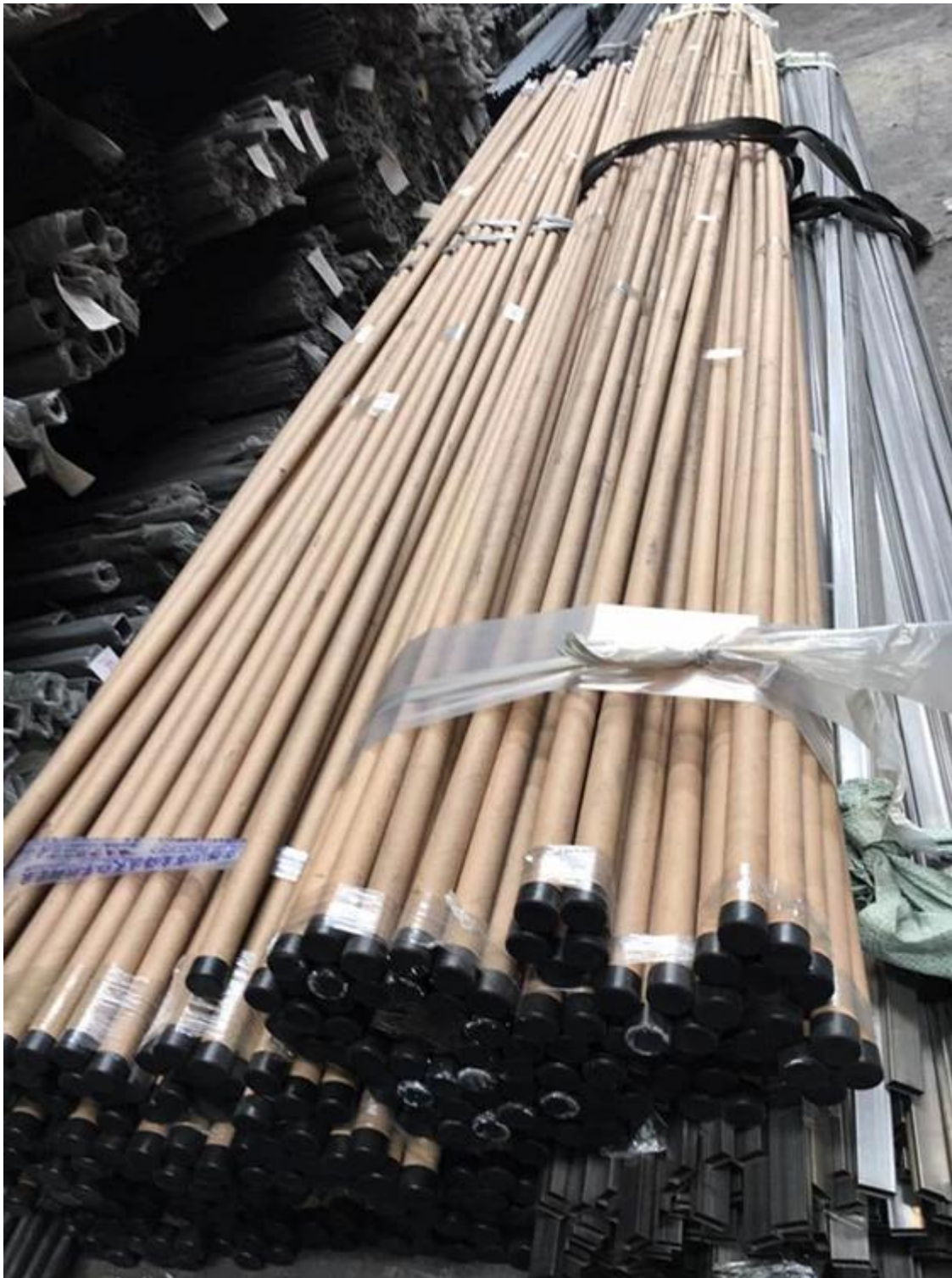
Metal frame (100 pieces into one metal frame)