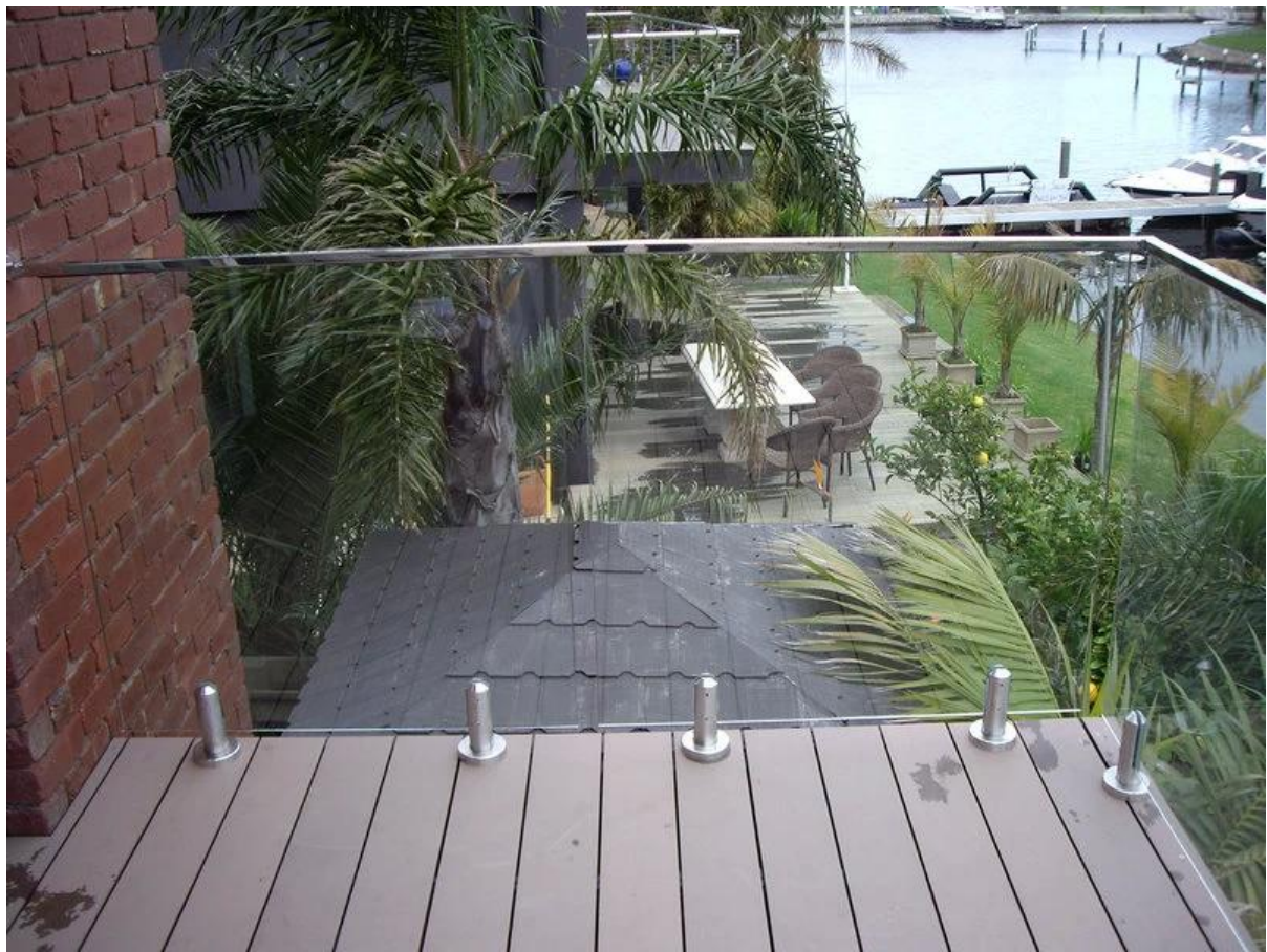
Pool fence side;