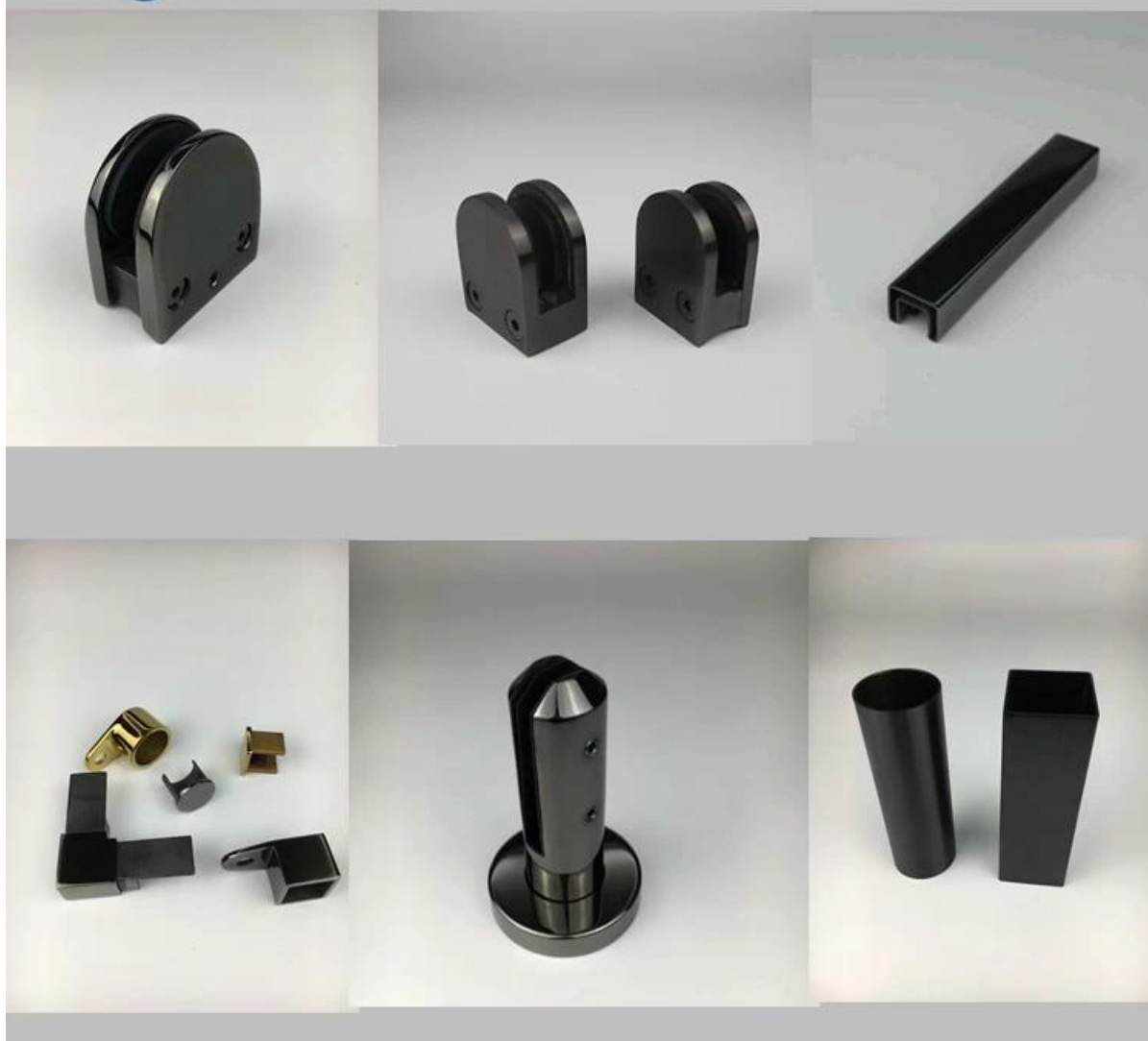
Related products - aluminum U channel