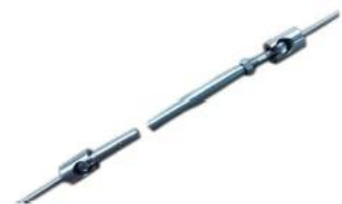
T809- 4mm/5mm cable