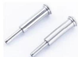
T807- 3mm/4mm cable