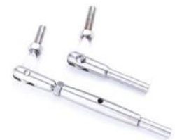
T804- 4mm/5mm/6mm cable