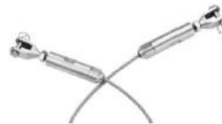
T803- 3mm/4mm/5mm cable