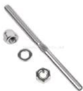
T805- 3mm cable