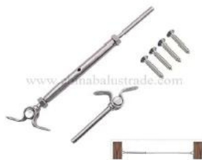
T806- 4mm cable