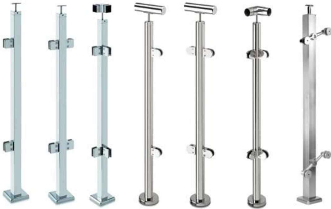
Stainless Steel Railing Handrails Projects Photos