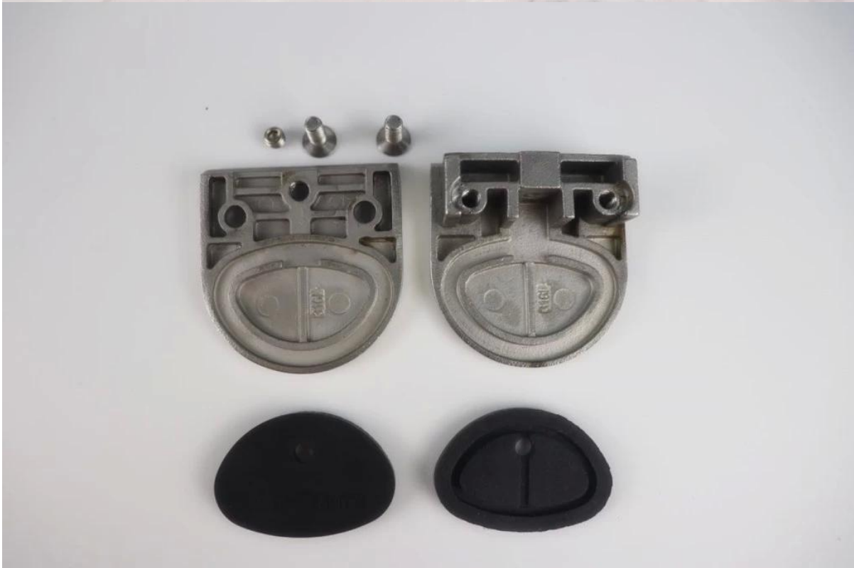
Different types of glass clamps with dimensions: