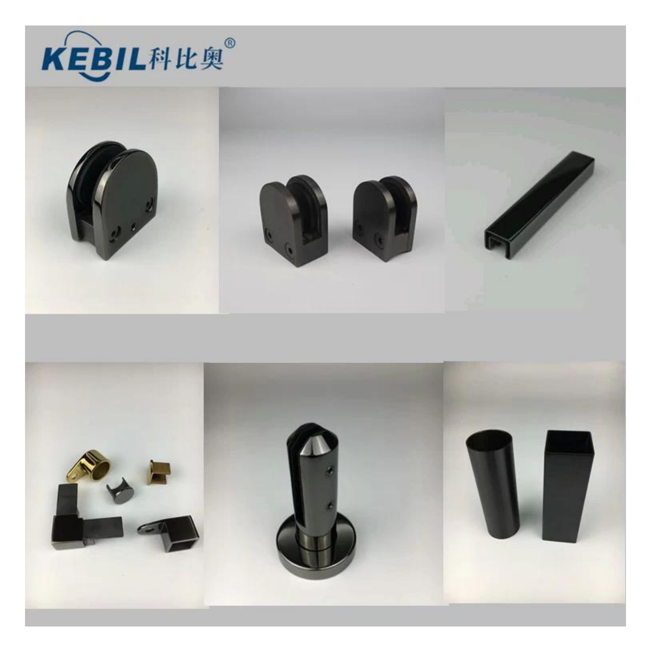
Related products -