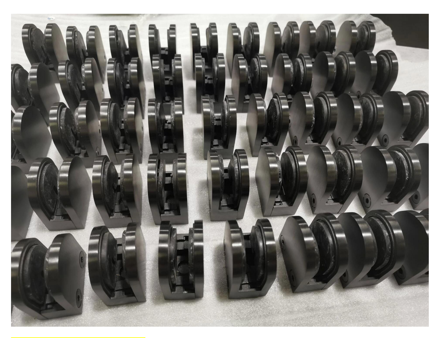
Othe clamp type available