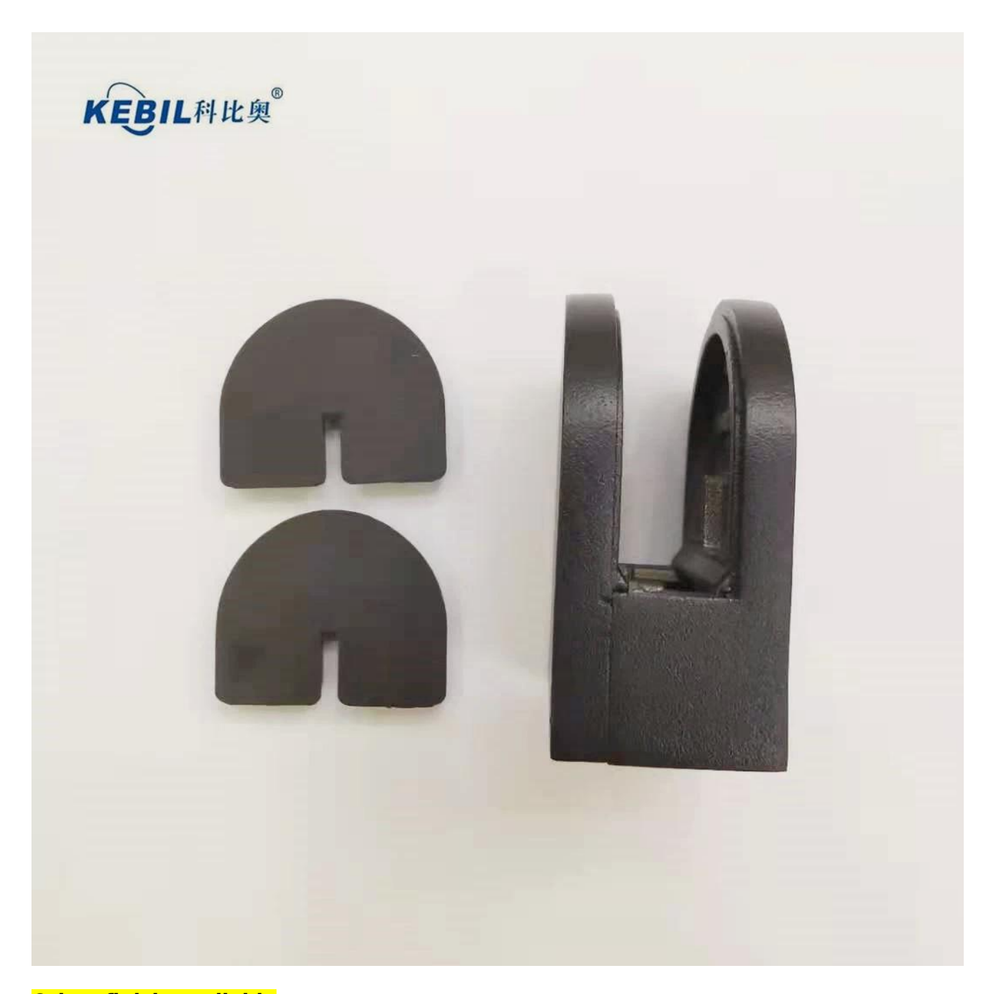
Other finish available