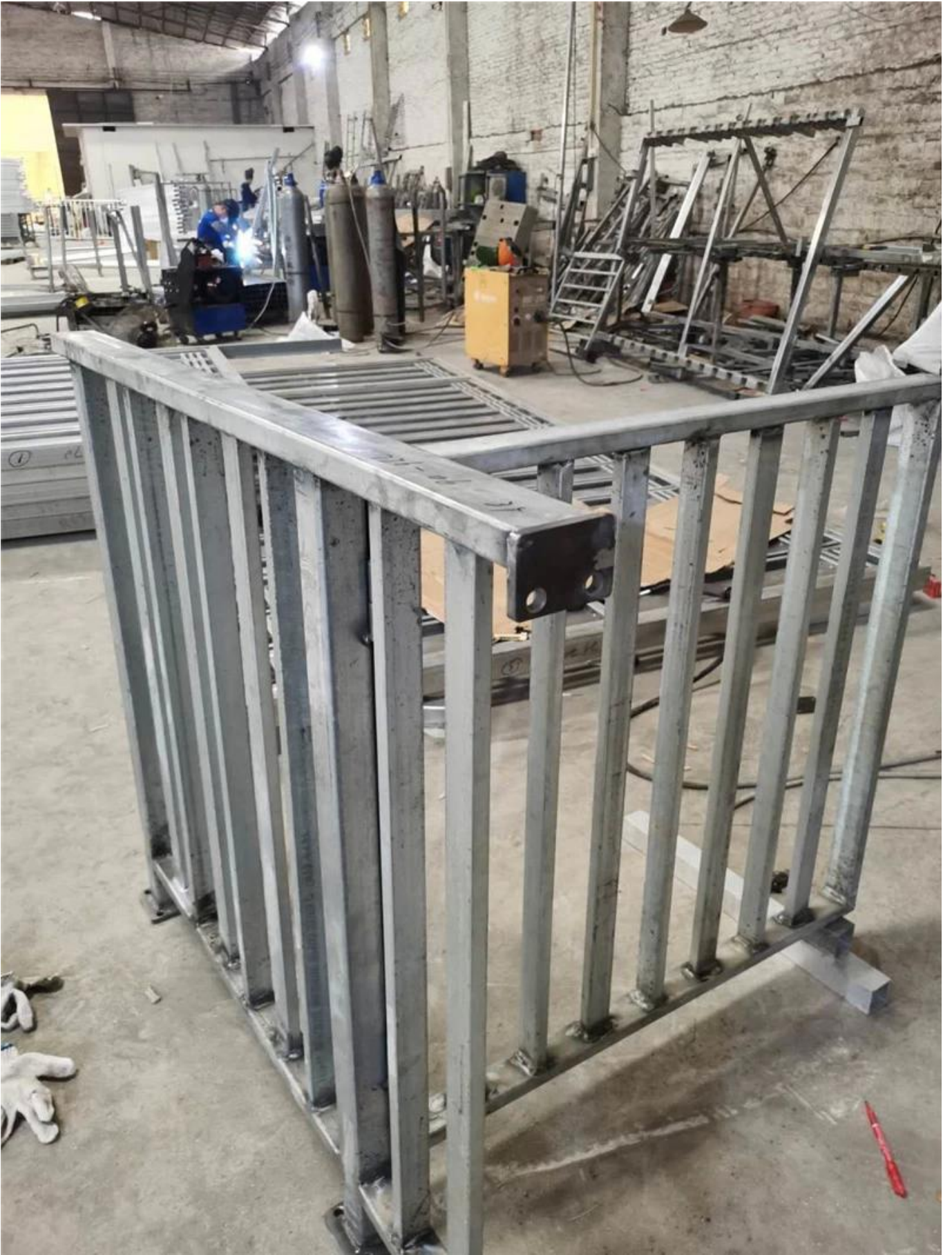
# Project photos of aluminum multi-line pipe railing designs-