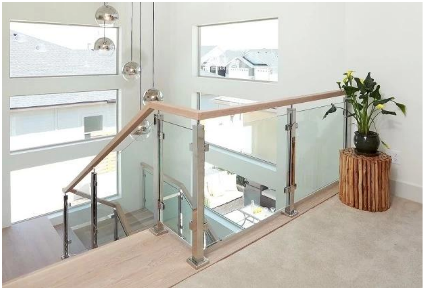
The glass railing clamp usually used with stainless steel post to hold glass panels, for balcony railing, terrace railing, staircase. Suitable for both indoor and out door.