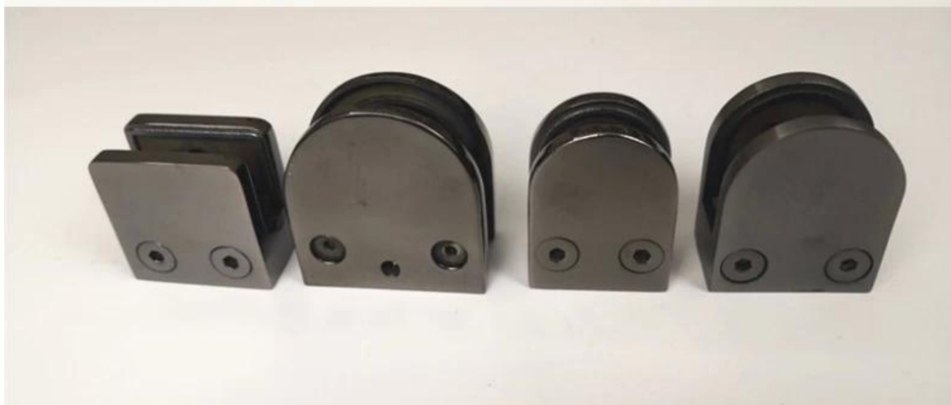
Different types of glass clamps with dimensions: