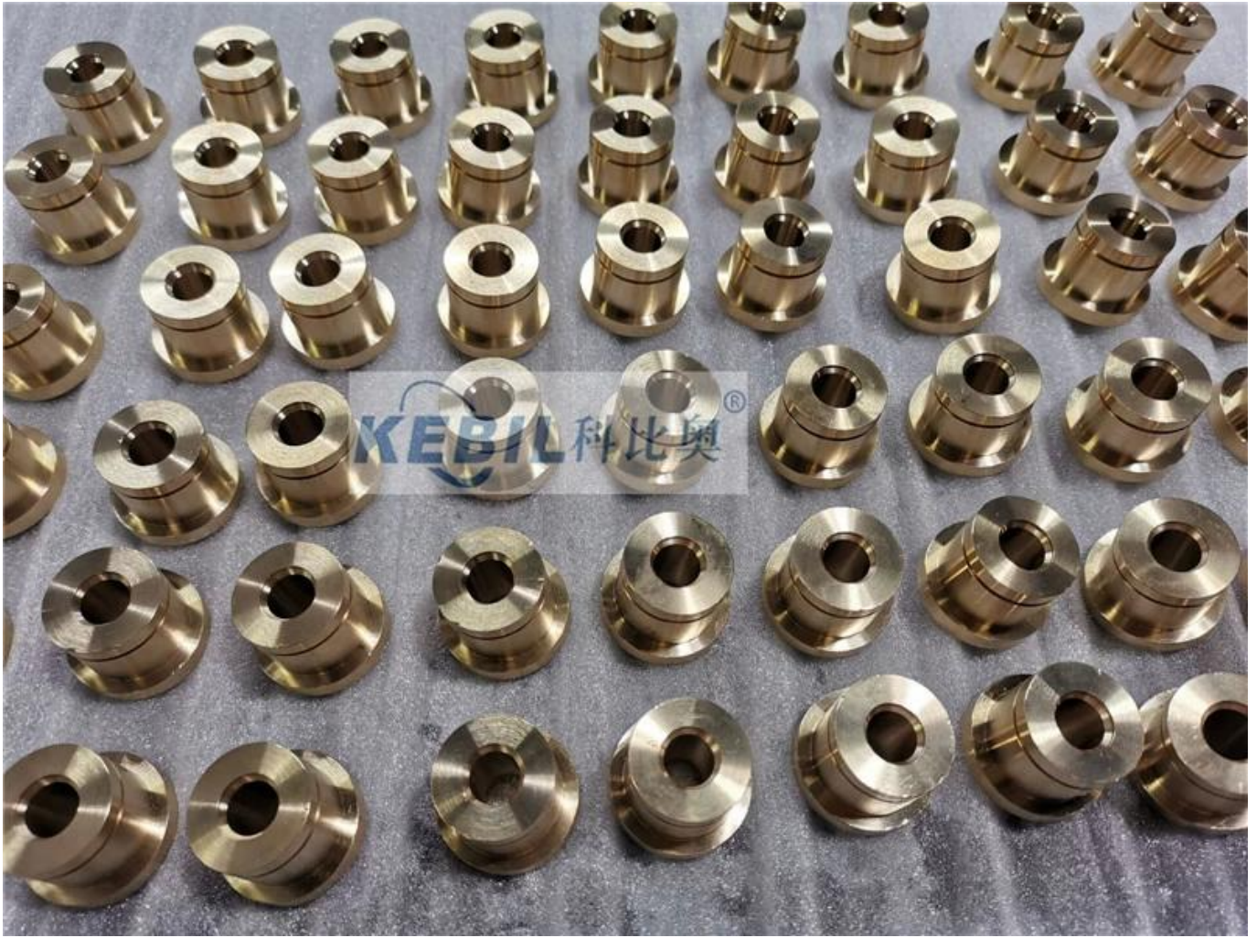
Brass wire rope ferrule drawing-