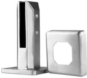
MODEL # SBM