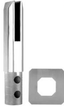
MODEL # SCM