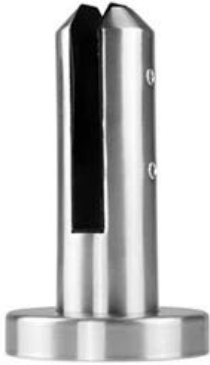
MODEL # RBM