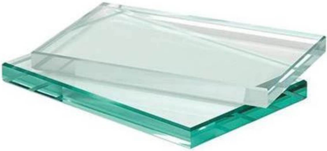
Glass spigot for glass railings-