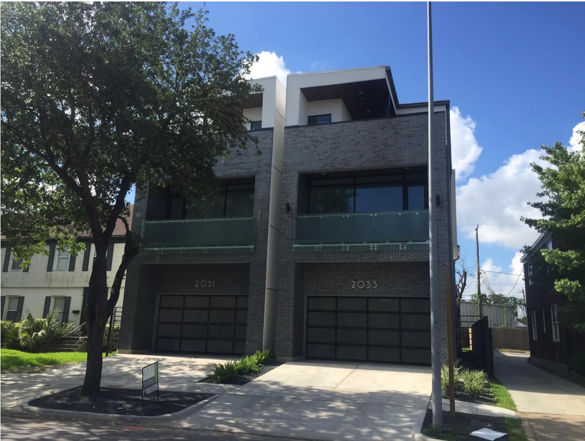
Related items - Tempered glass for glass railings , click photo for more details-