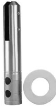
MODEL # RCM