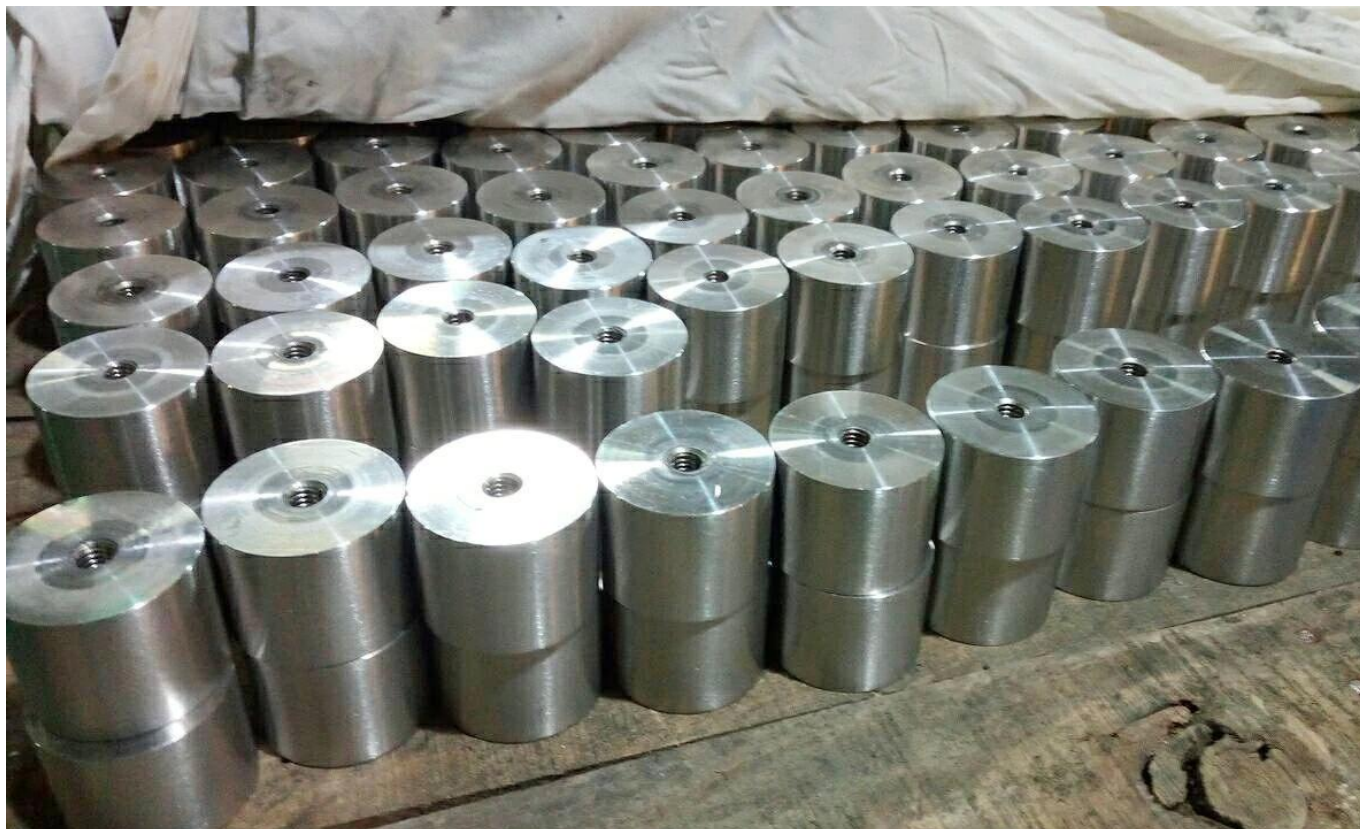
2# Model: Diameter 50mm x 44mm Long Base Standoff