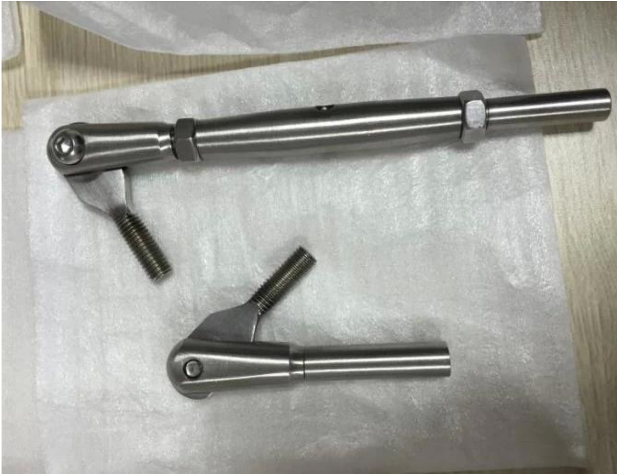
3) Wire rope tensioner T807A - hydraulic crimper required to tighten.