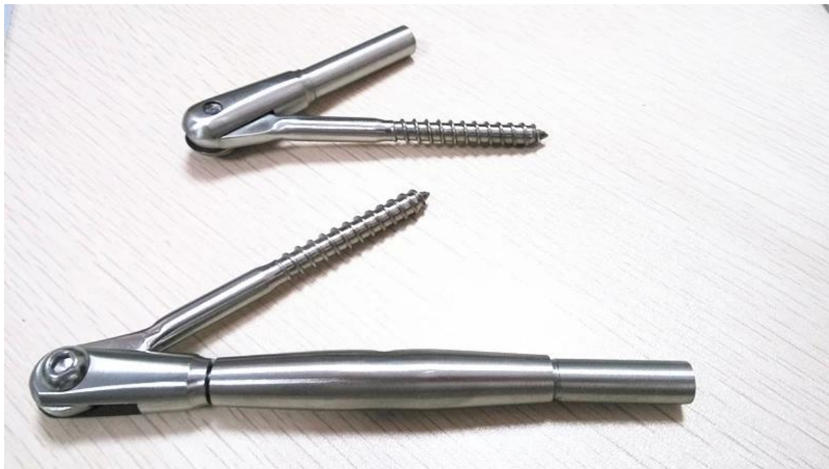
Cable tensioner T804 with bolt fixing into steel post.