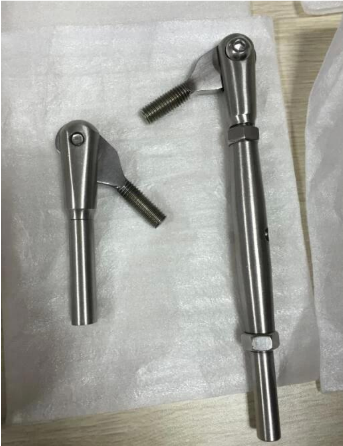
2) Cable tensioner T804 dimension