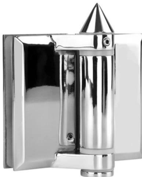
2. Glass to wall/square post hinge