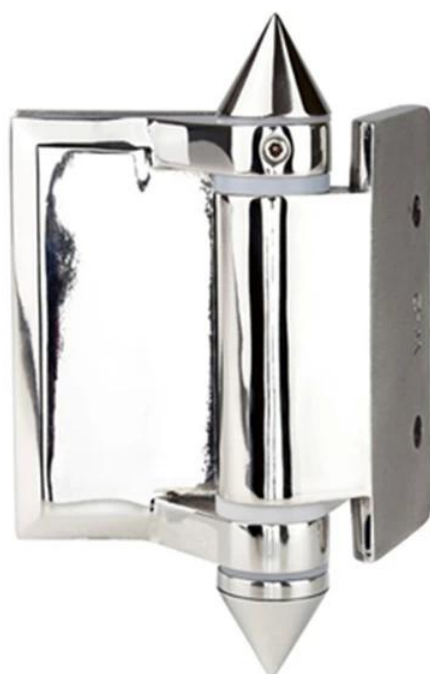
3. Glass to round post hinghe