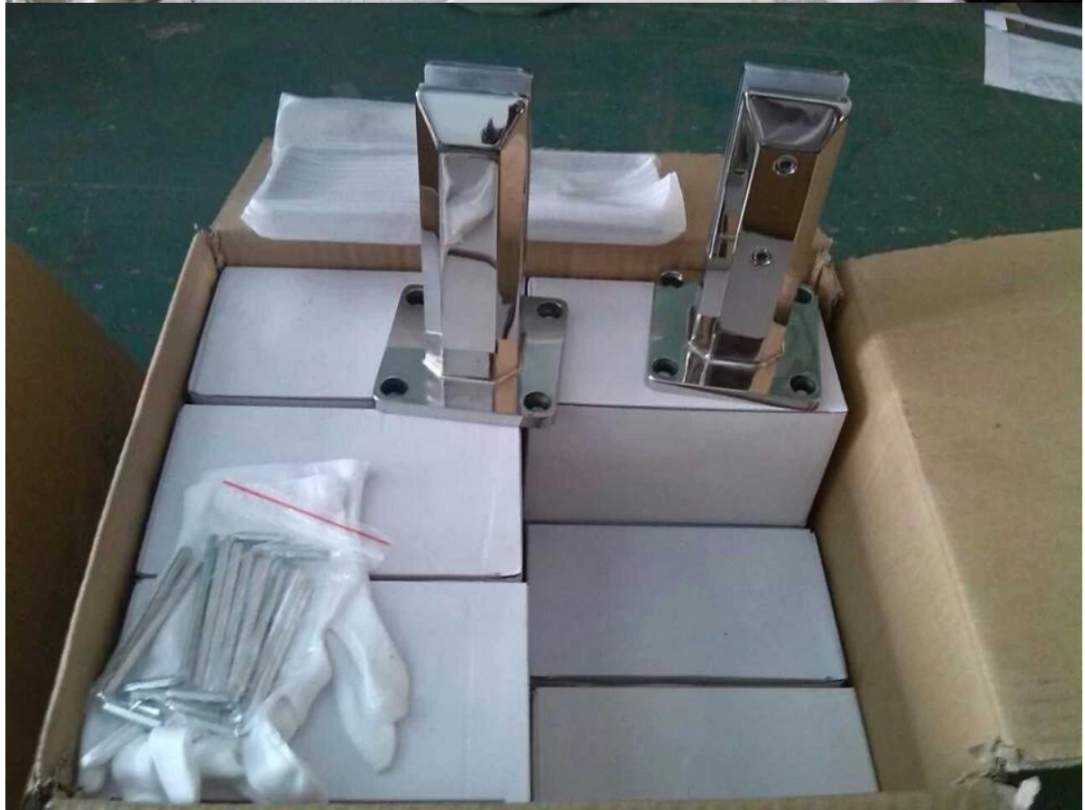
Factory & Certification