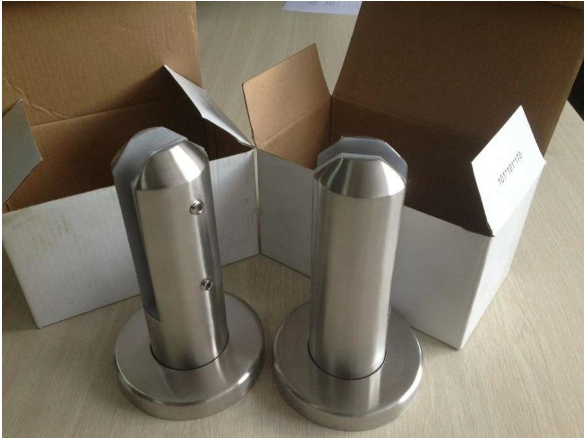
5.project pic for balcony balustrade