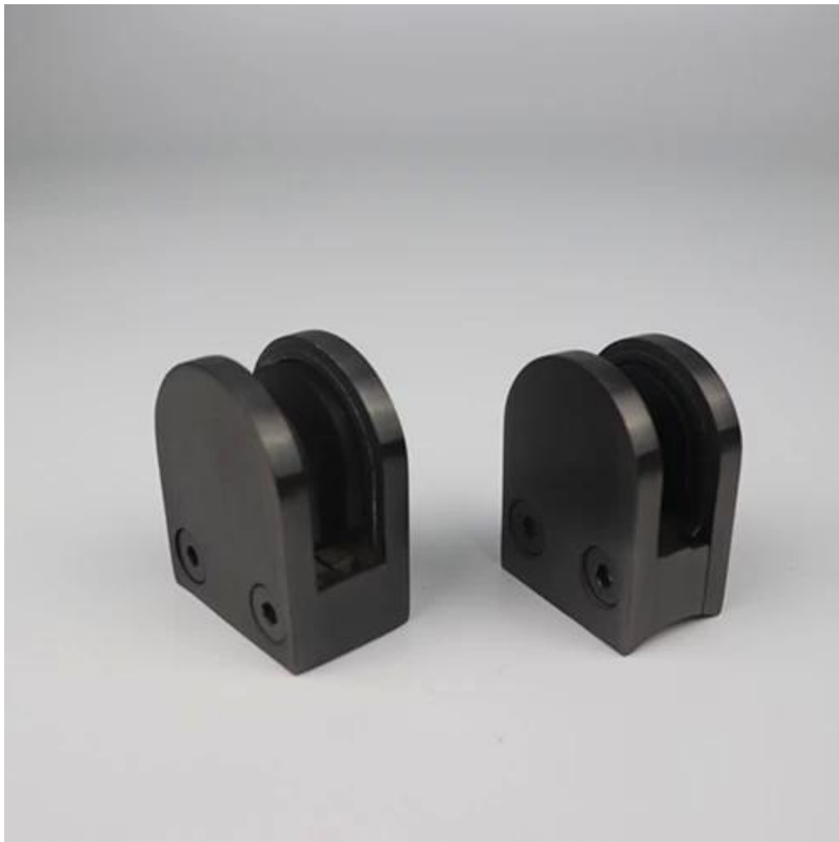
New design timber look glass clamp