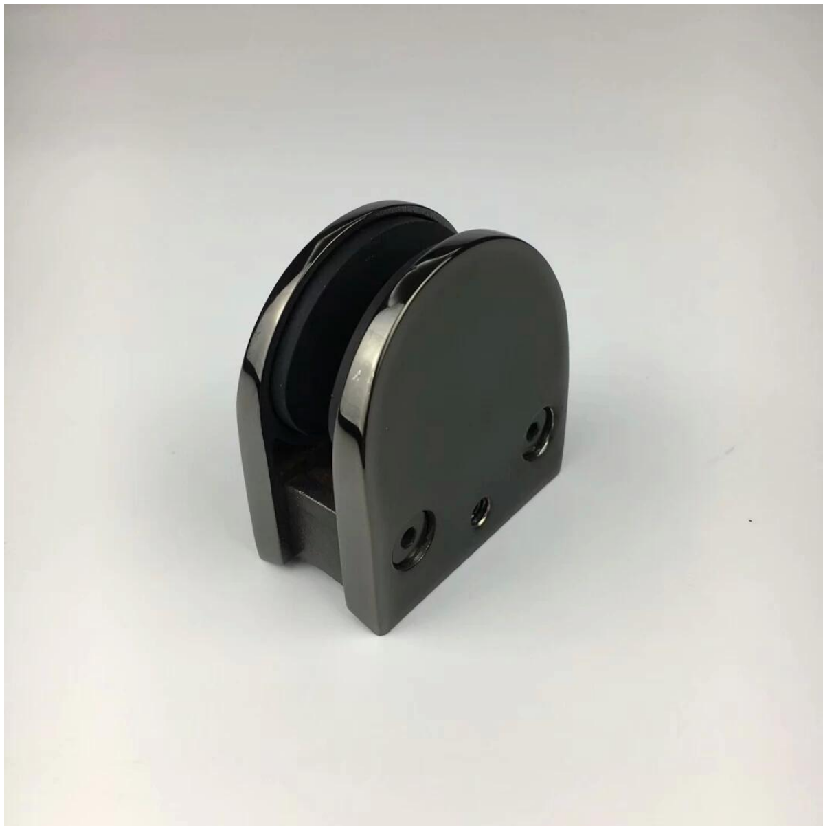
Electroplated black finish glass clamp - matte finish