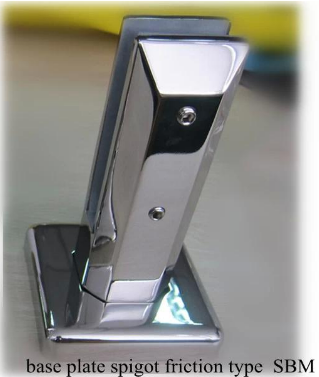
base plate spigot friction type SBM