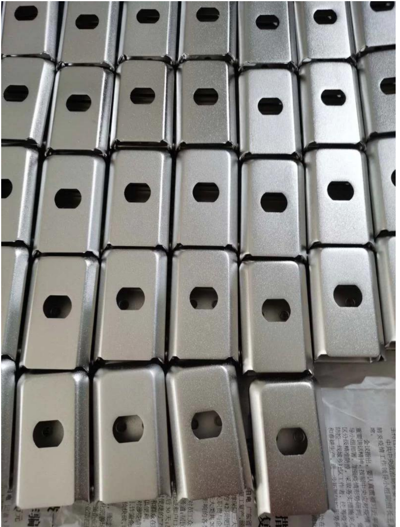
Other OEM products