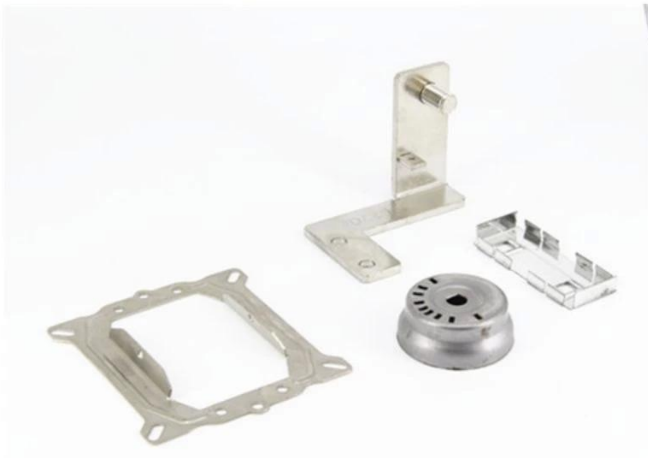
Sheet metal stamping products