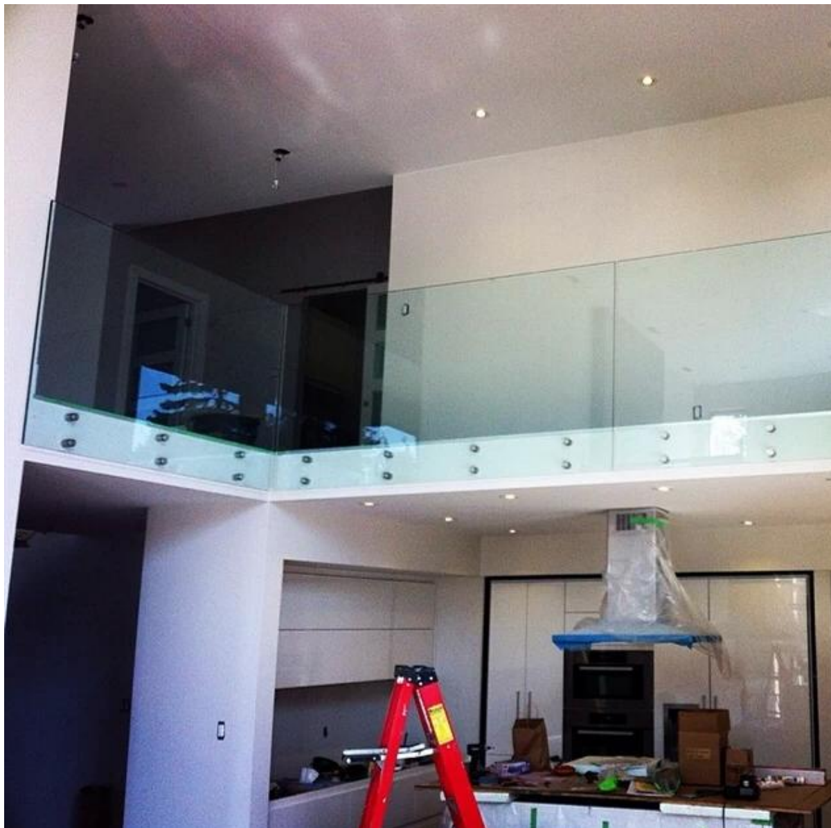
outdoor and indoor glass standoff, frameless standoff glass railing design, stainless steel glass standoff bracket