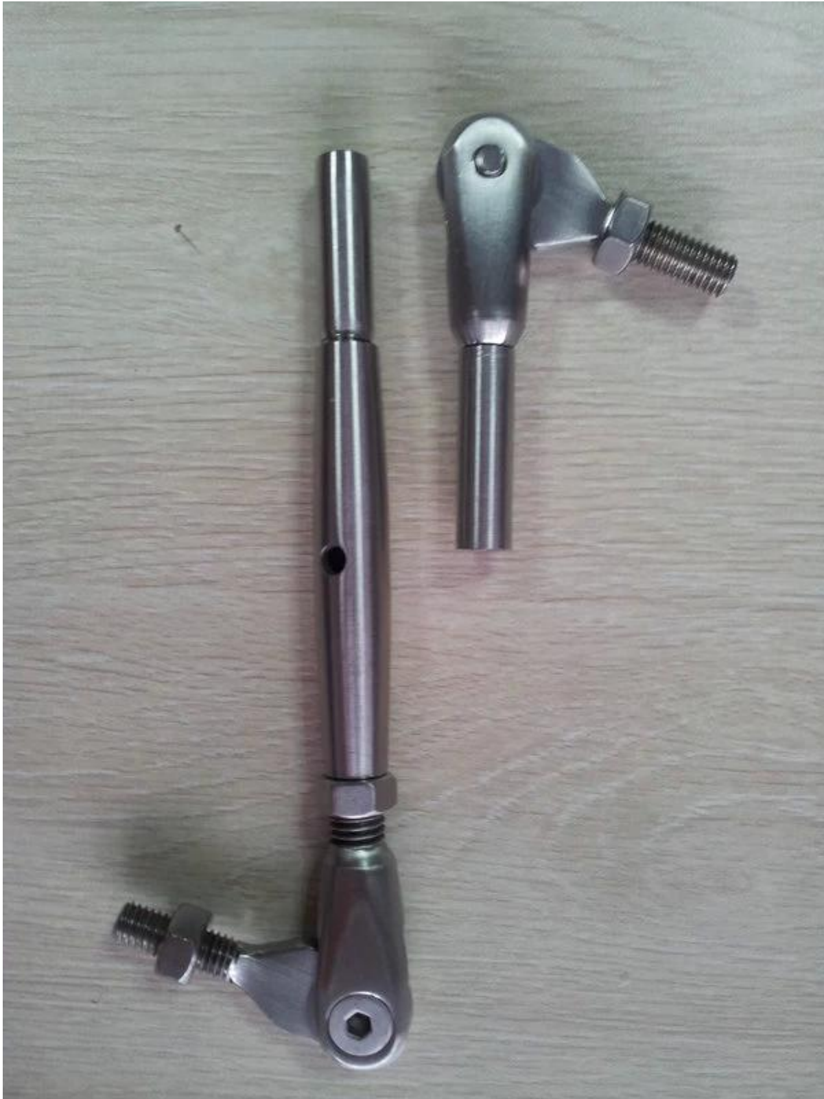
T804 project in Michigan, USA