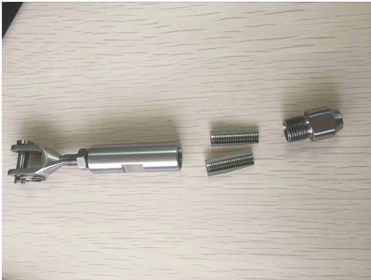
Cable tensioner installation