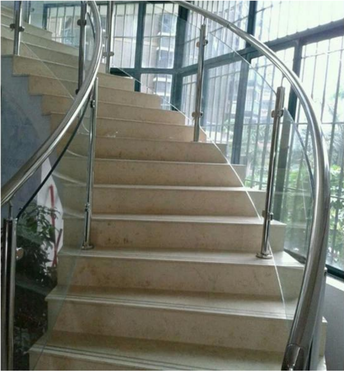
intermediate post 2 way 180 degree and corner post 90 degree