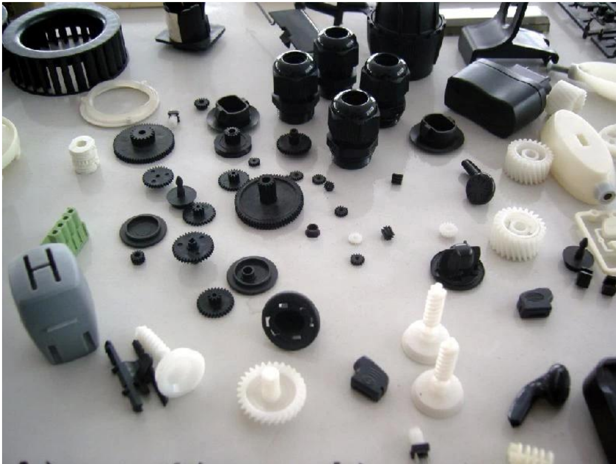
Factory & Equipment