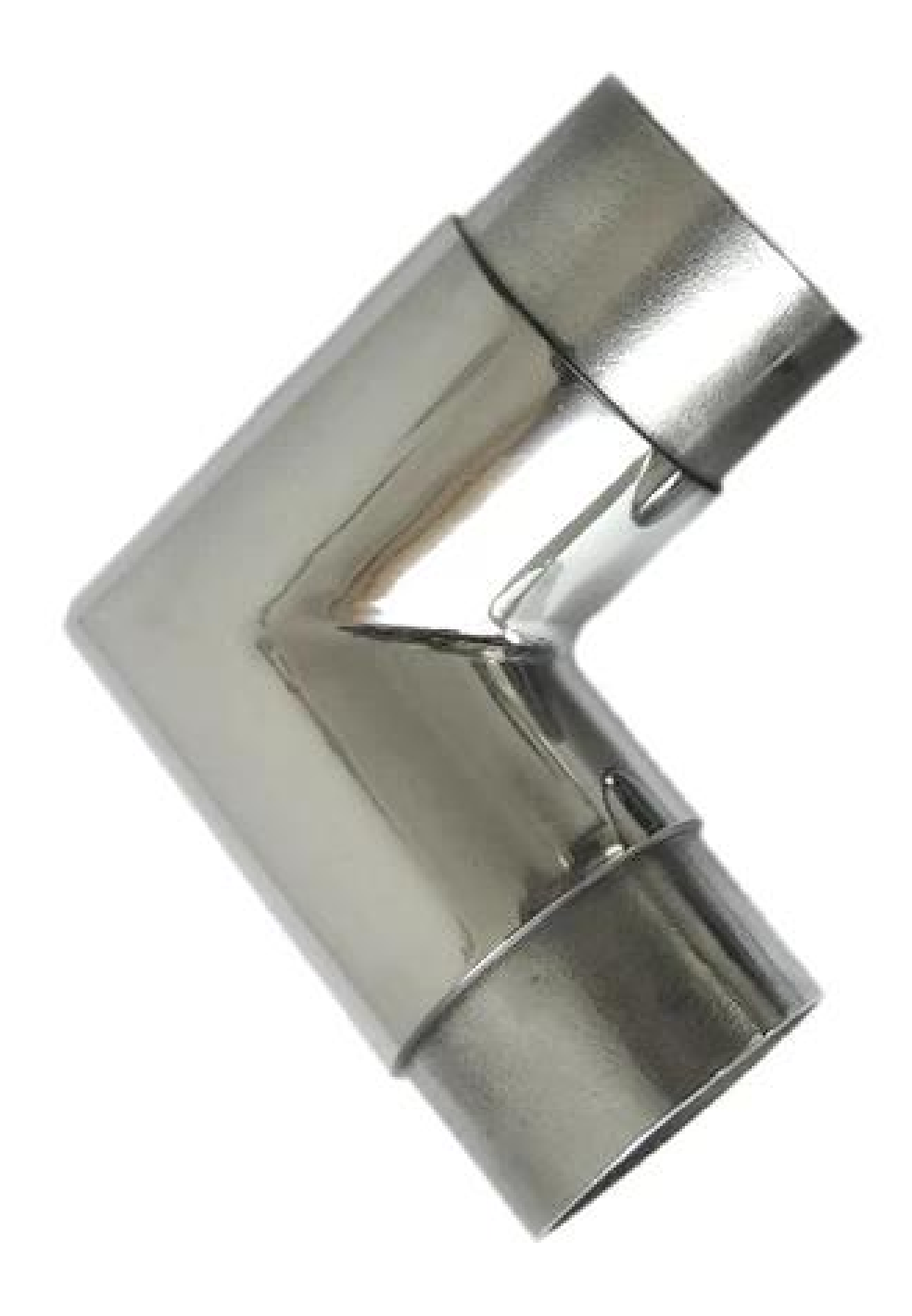
stainless steel handrail tube joint, handrail tube connector, wrought iron railing pipe joint