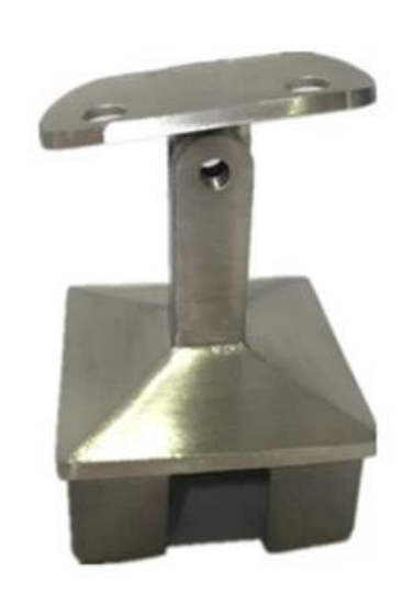
for 40x40x1.5mm, 50x50x1.5mm pipe