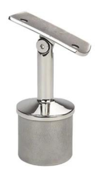
for dia38.1x1.5mm, 43x1.5mm,50.8x1.5mm pipe