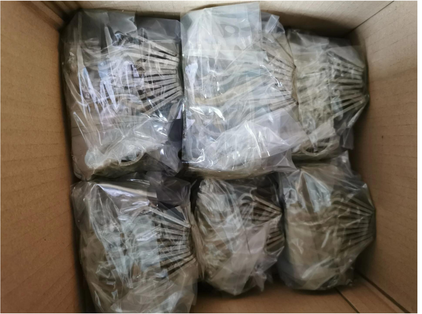
Sheet Metal Stamping Products