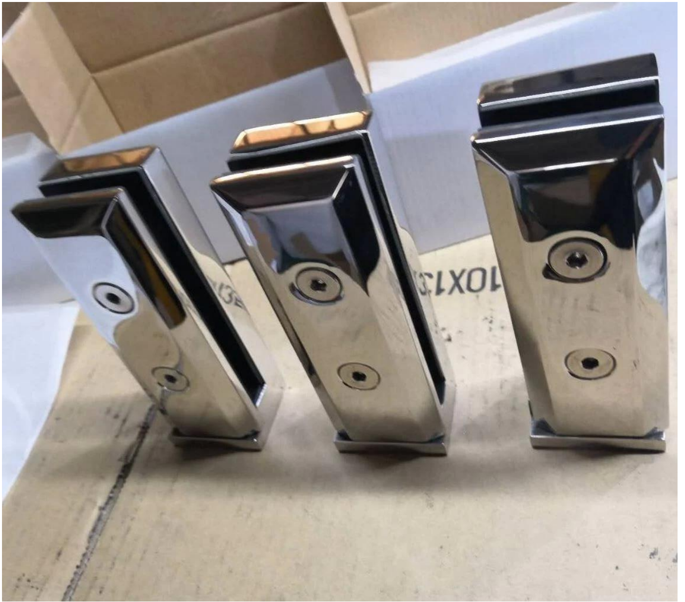
2) Side mounting glass spigot size