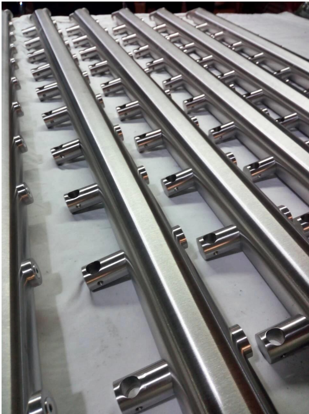
Rod Balustrade Handrail Projects