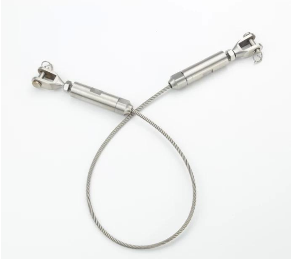
2) Cable / wire rope