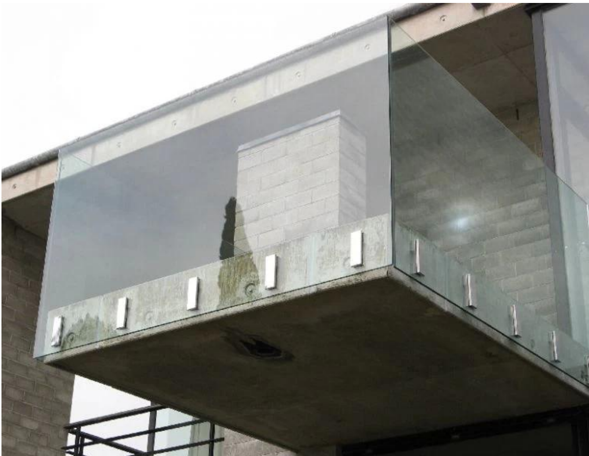
Fascia mount frameless windscreen glass spigot clamp Safety