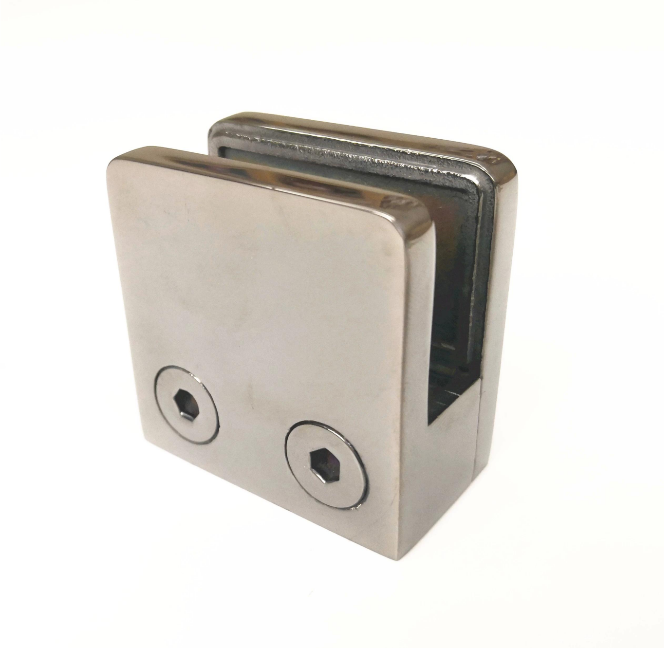
II. Production & Packing details of D shape Glass Clamp-