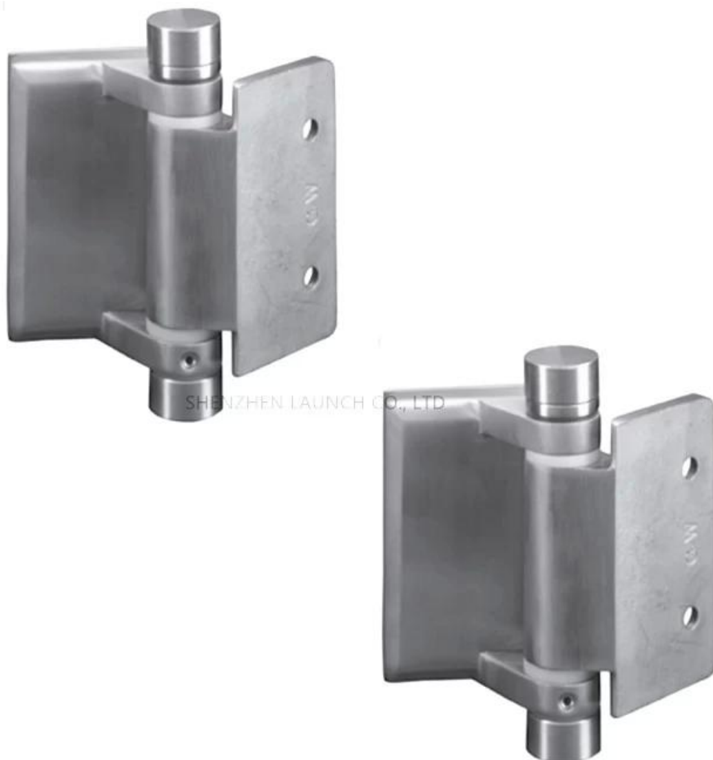
Glass to round post hinge-