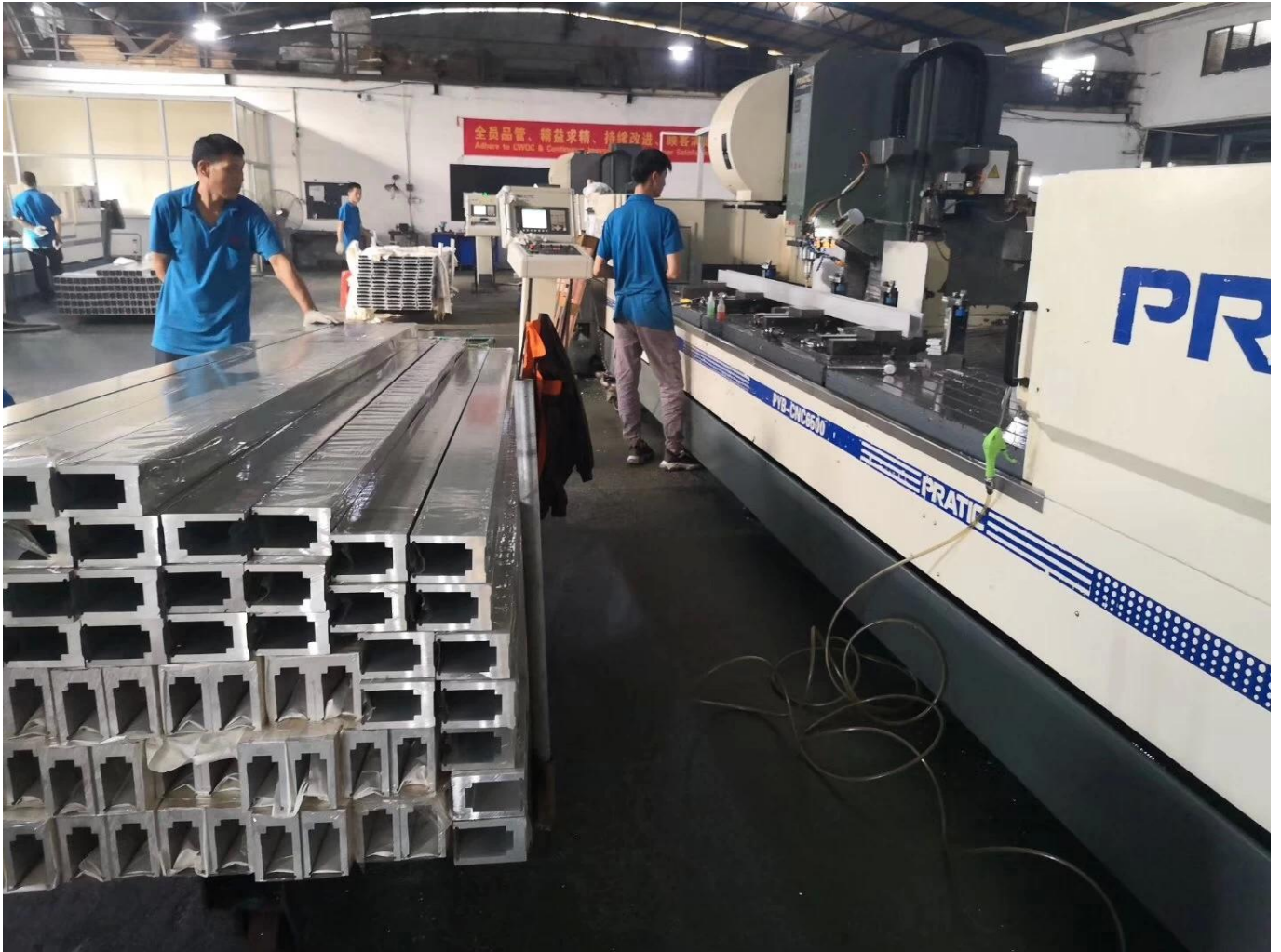
Project photos of aluminum U channel glass railing balustrades-