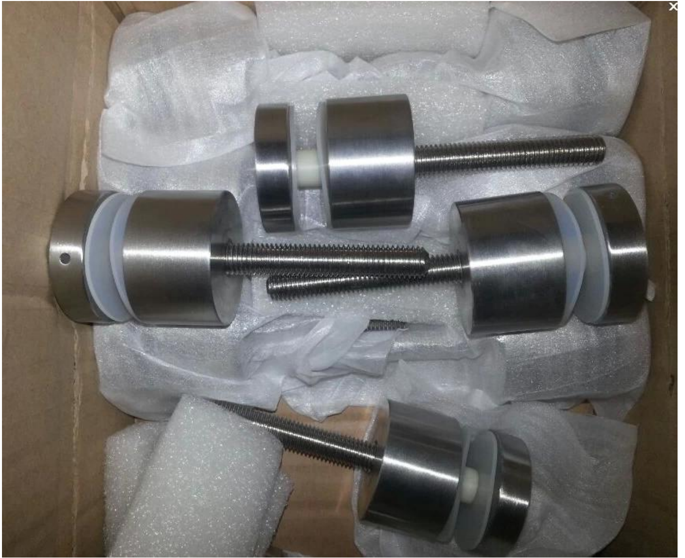
Stainless Steel Glass Standoff Railing Project: