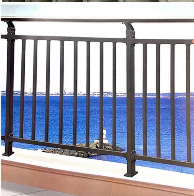
Production photos of steel newel posts-