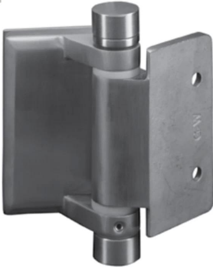
Glass to square post/wall hinge, G-W, with coned cap on the ends