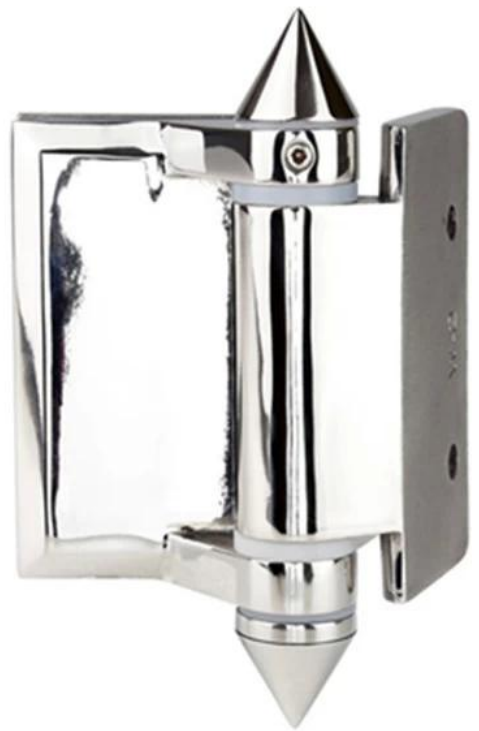
Glass to square post/wall hinge, G-W, black powder coating