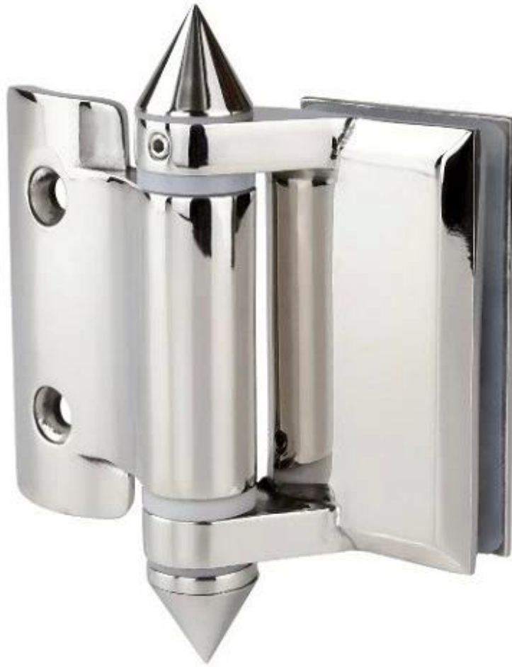
Glass to round post hinge, with coned cap on the ends