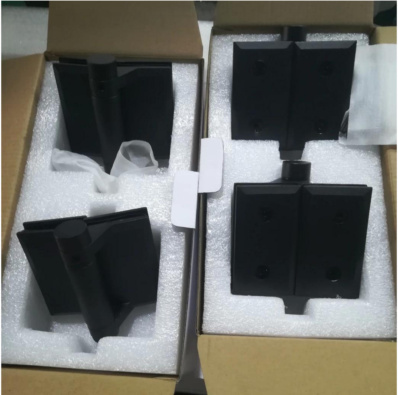
Glass to round post hinge, G-R, with flat cap on the ends