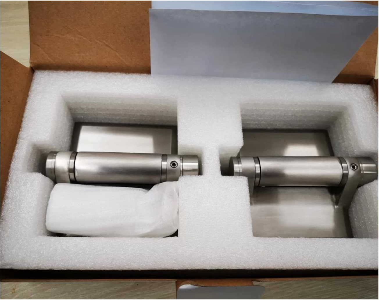
Glass to glass post hinge, with flat cap on the ends, in black powder coating