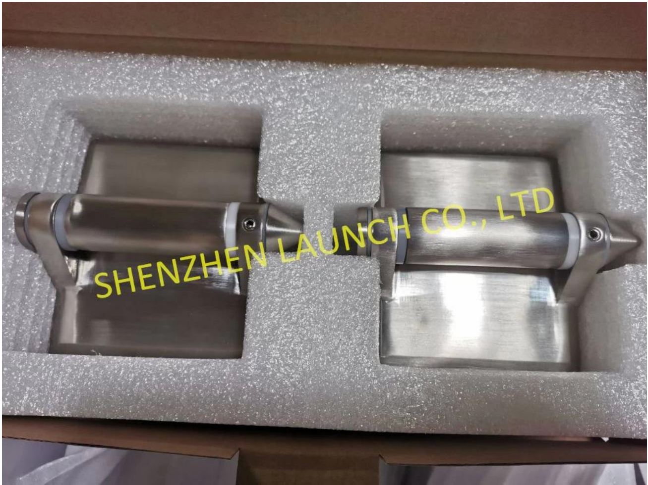
Glass to glass post hinge, with flat cap on the ends