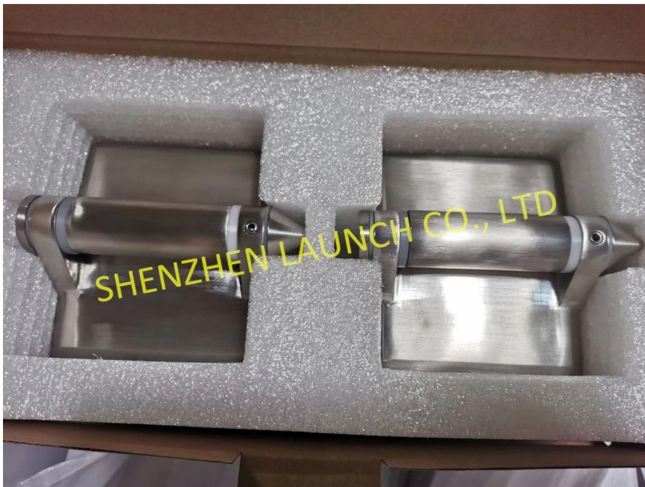
Glass to glass post hinge, with flat cap on the ends