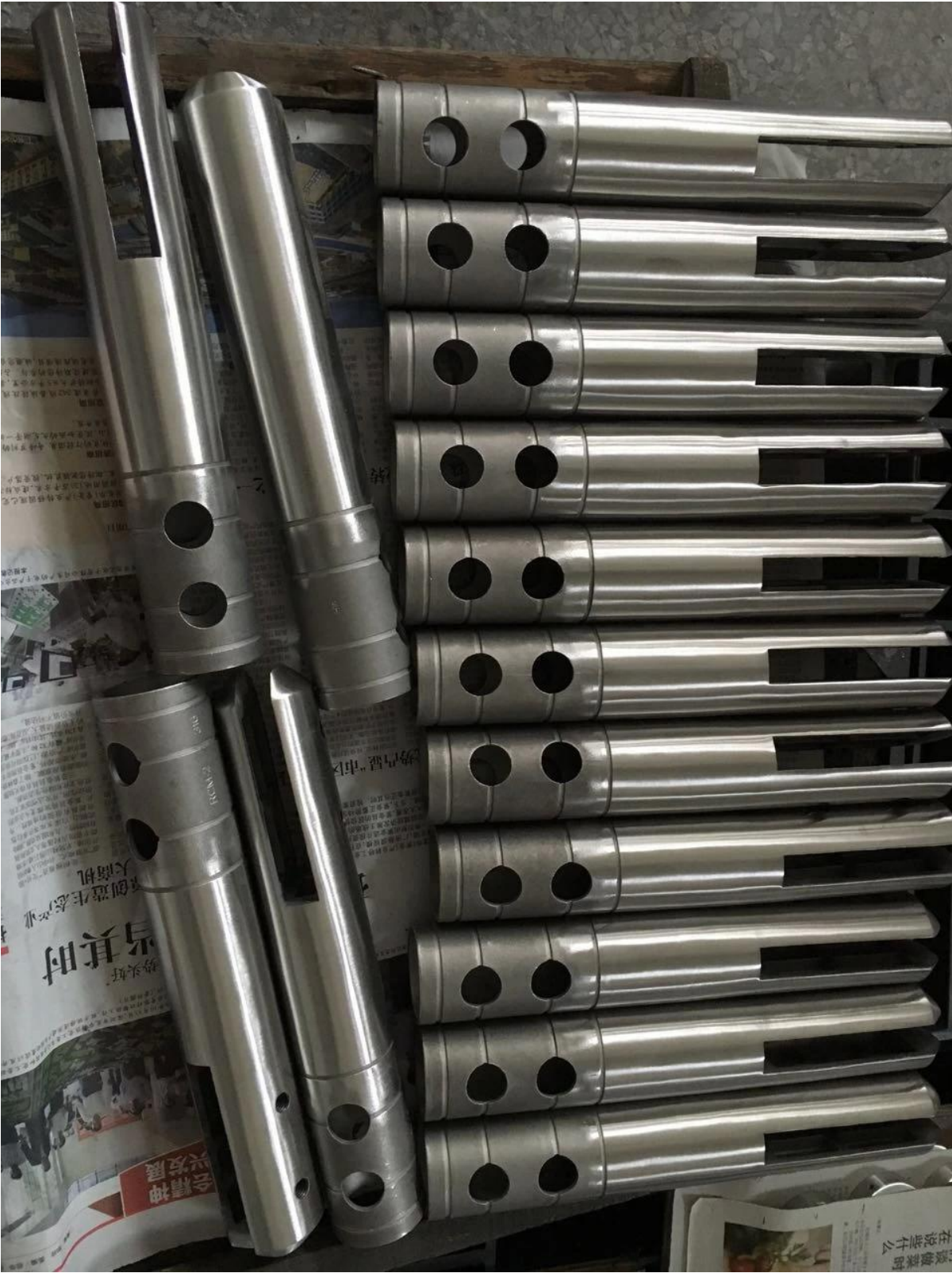
3) Glass spigot factory