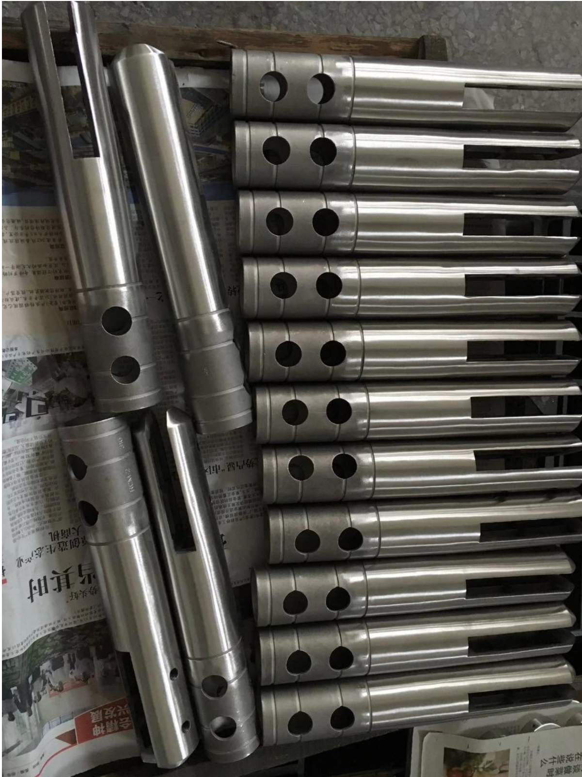
3) Glass spigot factory