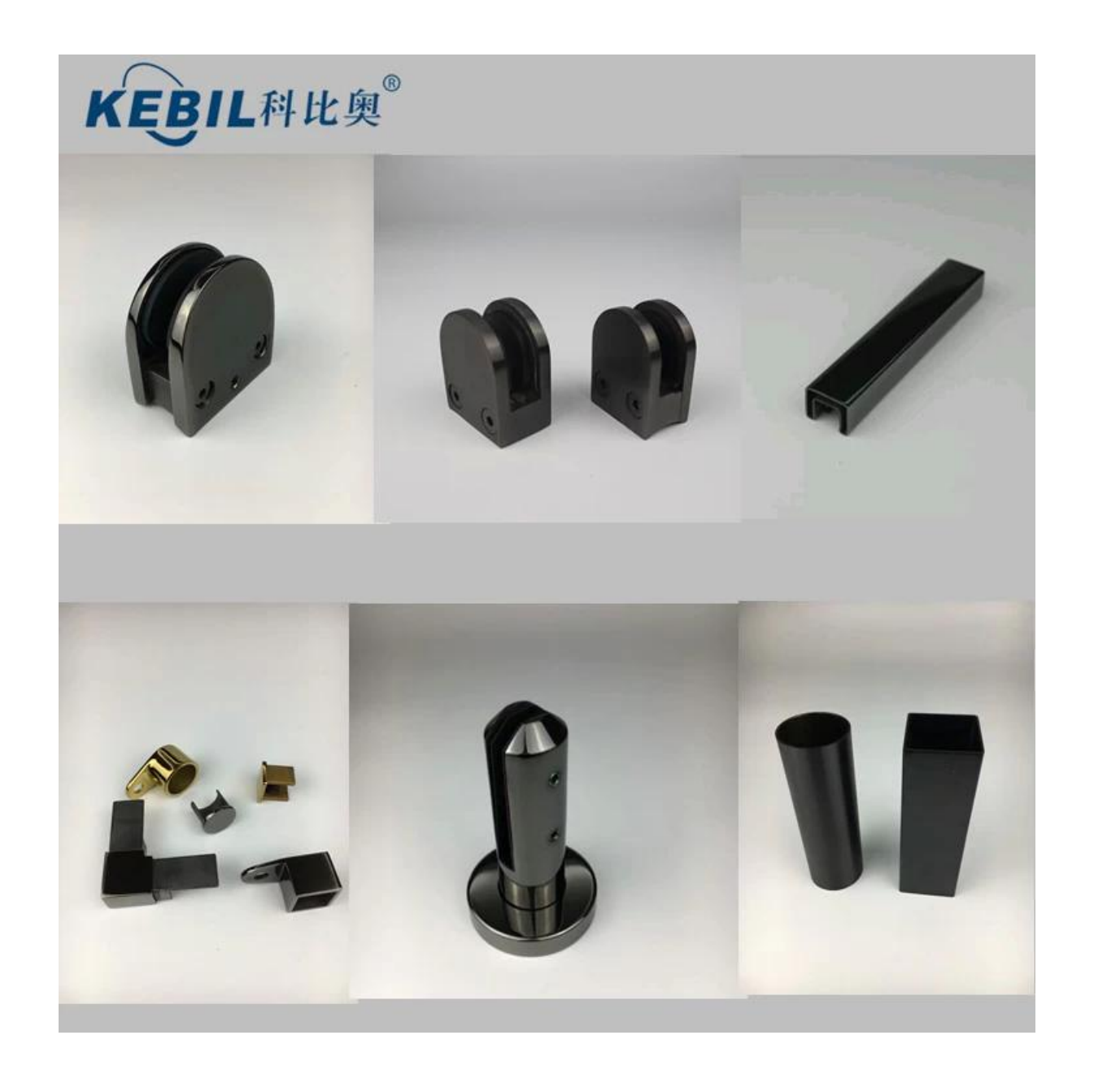
Black Balustrde Stanchions Project