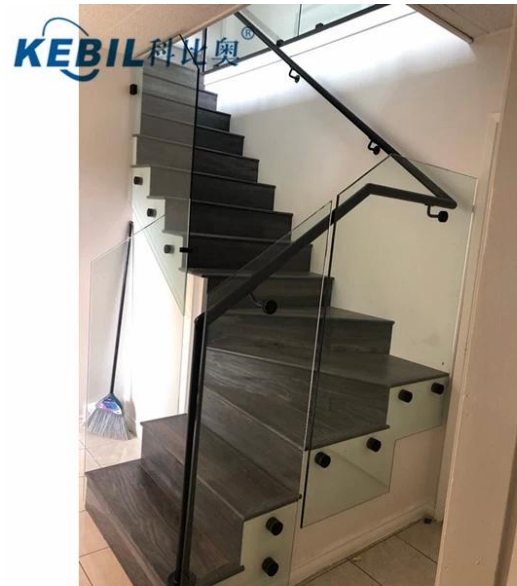
Glass Holder Standoff Bracket Project Photos