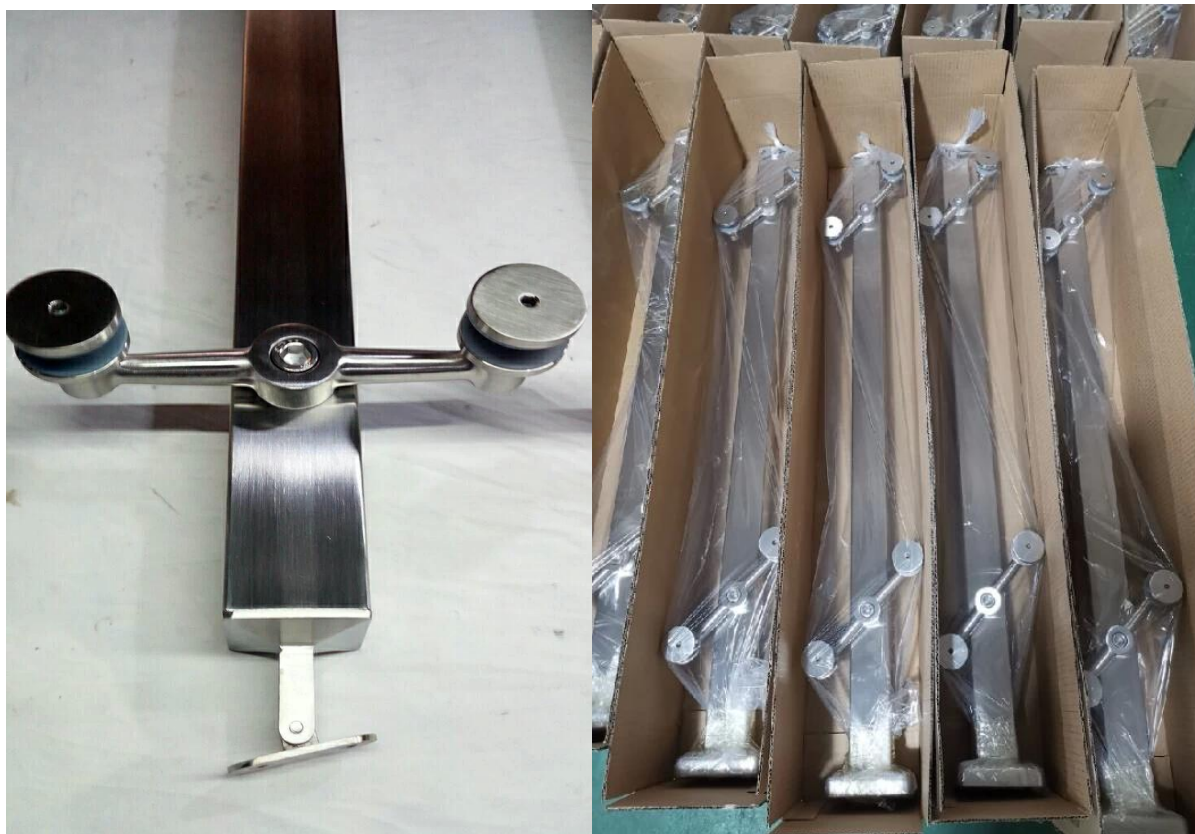
Spider glass fittings handrail project photos