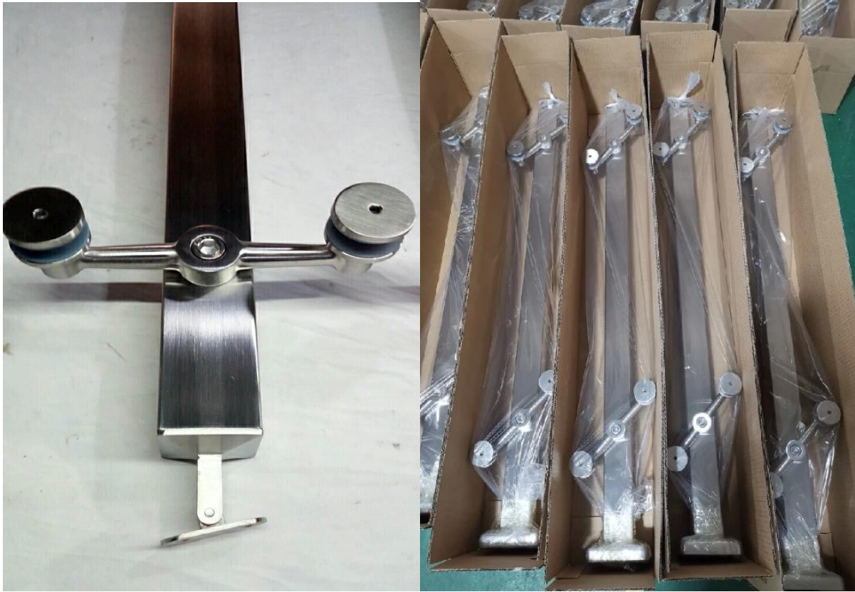
Spider glass fittings handrail project photos