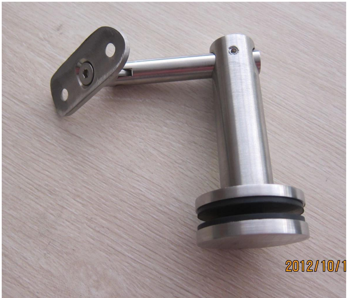
Polished handrail bracket