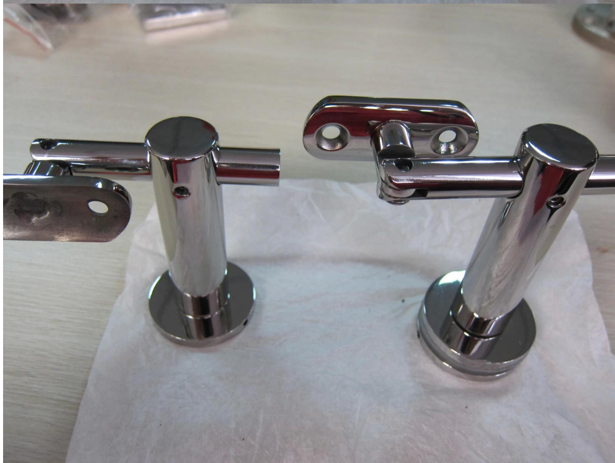
Handrail bracket P707 size