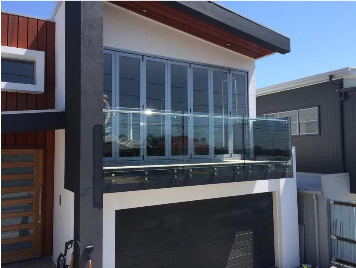
Standoff for stair case railing