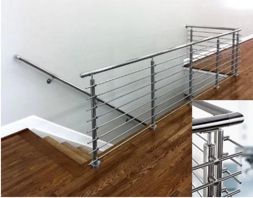
Top/Side Mounted Design Crossbar Balustrade Post: