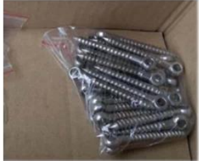
Wood screws , for wood mount