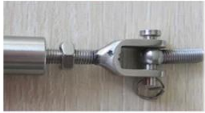
Mount to steel or concrete