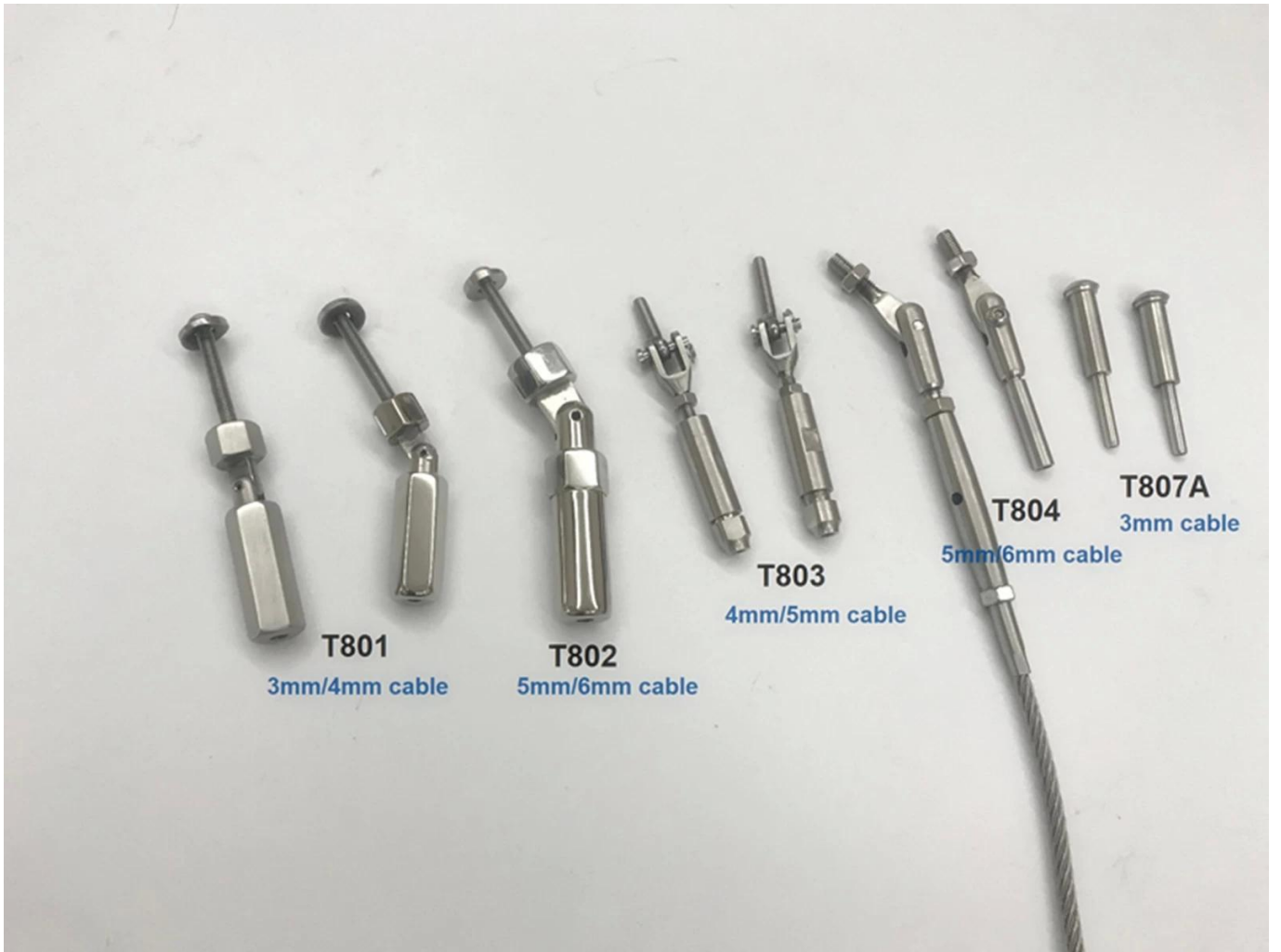
Cable wire railing designs with tensioners -