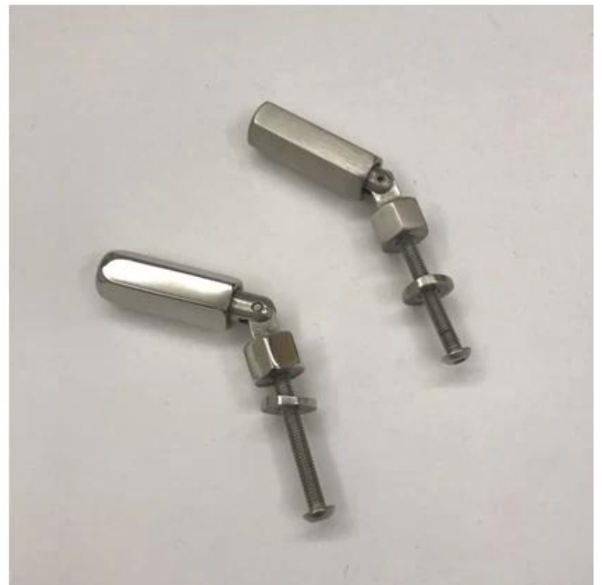
Model T802 , stainless steel cable tensioner for diameter 5mm and 6mm cable: