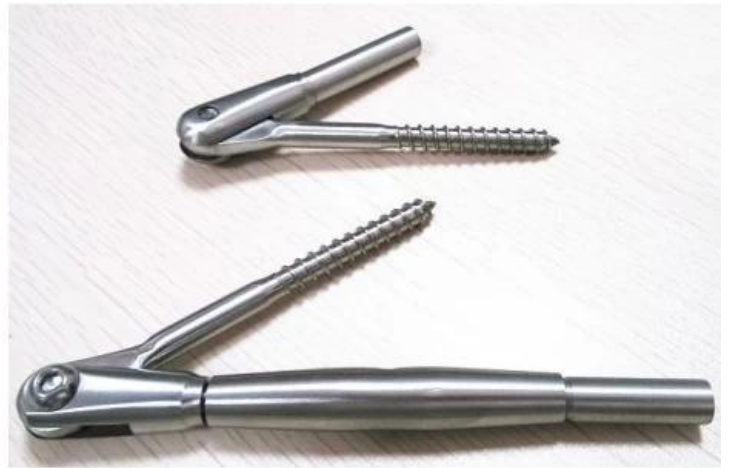
Model T801 , stainless steel cable tensioner for diameter 3mm and 4mm cable: