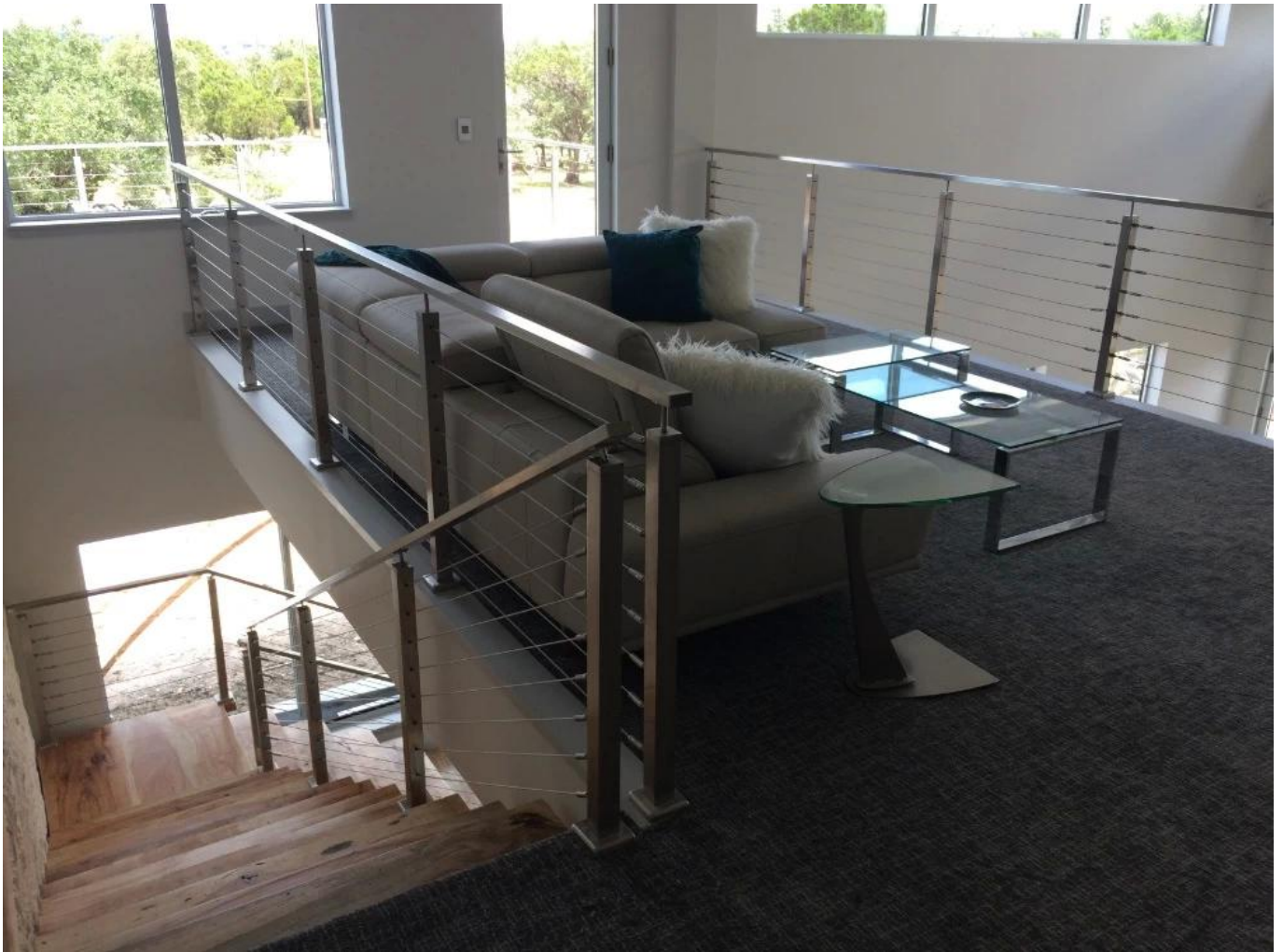
Stainless steel wire cable railing design for outdoor staircase or deck railing design: